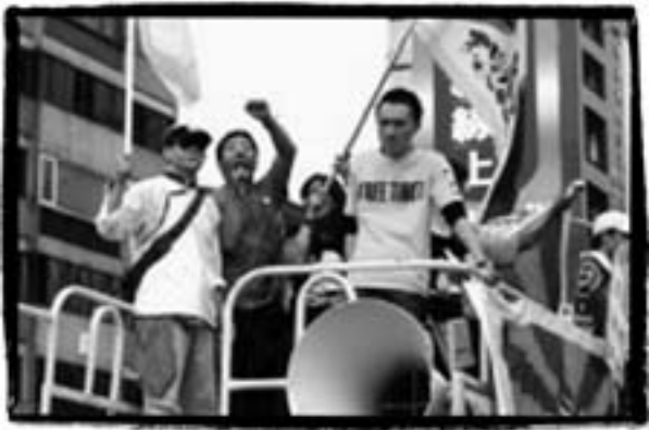
SFT Taiwan makes March 10th heard in mainland China