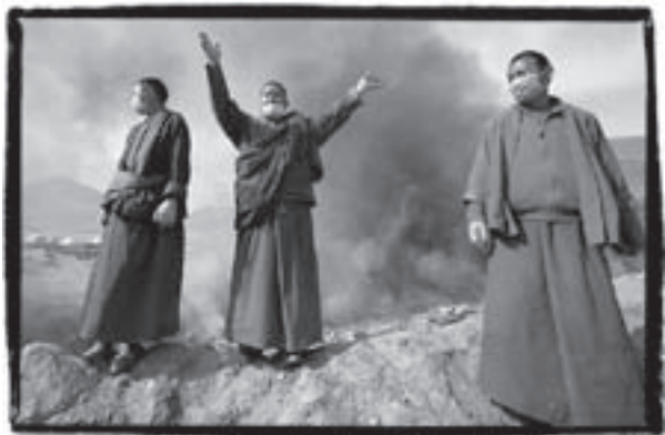
Monks were among the first to join relief efforts in Kyekundo.

Read Jamyang Norbu's informative article about Kyegundo: www.jamyangnorbu.com