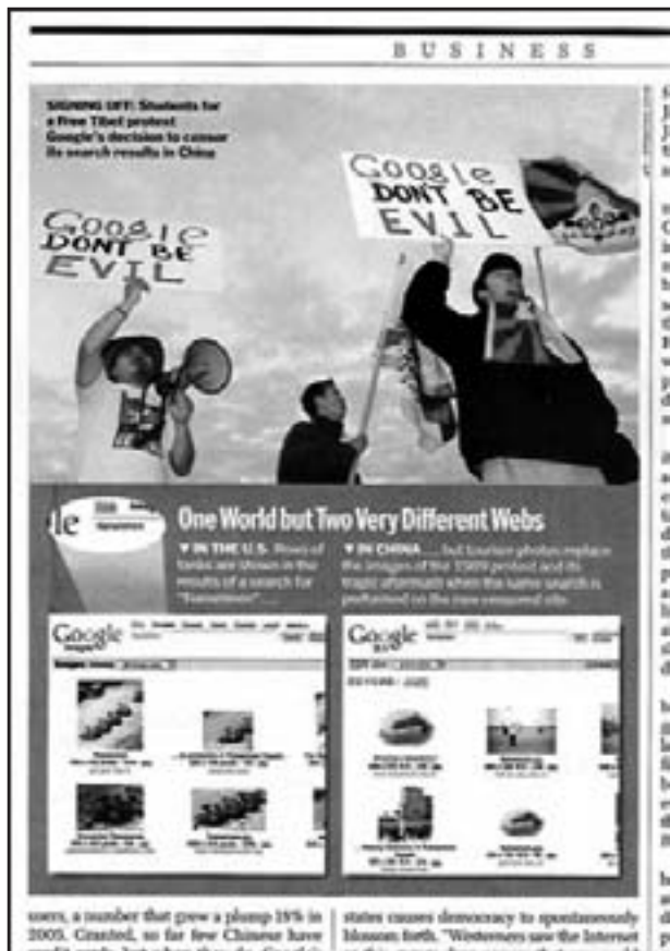
SFT breaks up with Google in 2006, makes up in 2010

Two months after Google's announcement that it would stop censoring search results in China, the company made history by replacing Google.cn with Google.com.hk, its uncensored search engine in Hong Kong.