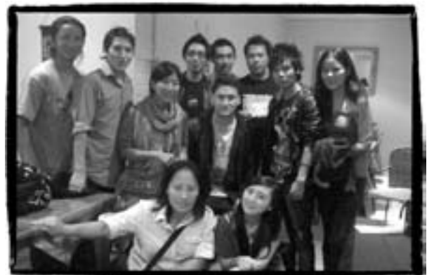
Tendor with Tibetan youth in Melbourne after an SFT talk

rights in Tibet. If you are in the UK, please join our Rangzen Circle – SFT UK's monthly giving program ( http://www.sftuk.org/donate-us/ )