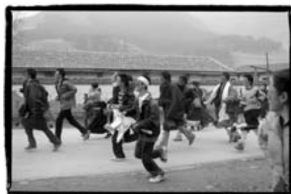
Students in Labrang protest in the streets

On March 10th, 2010, when all areas of Tibet were under military lockdown, dozens of Tibetan students in Zoege County, in the north-eastern Tibetan province of Amdo, defied Chinese authorities by wearing traditional Tibetan clothing and lighting butter lamps in honor of the Tibetans killed in China's violent crackdown during the 2008 uprising. This peaceful act of defiance and solidarity was met with harsh punishment as Chinese authorities detained 16 students and expelled 3 Tibetan teachers.