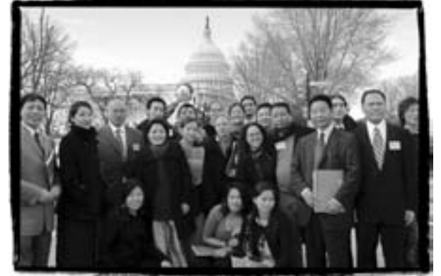
Tibet day lobbyists break for a group photo in front of the State Capitol building