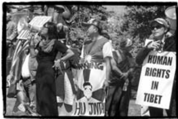
Hu Jintao gets an icy welcome from Tibetans and supporters

On April 12th and 13th, President Obama hosted nearly fifty world leaders at the Nuclear Summit in D.C. It was the largest gathering of heads of state organized by a U.S. President since Franklin D. Roosevelt in 1945. Much to the embarrassment of China, only one leader was protested: Hu Jintao. To the delight and satisfaction of every Tibetan and supporter present, Hu Jintao's motorcade, as well as President Obama's, stopped directly in front of our loud, flag-bearing, sign-waving crowd of activists. Our presence was noted, with Tibetan flags waving proudly, and our message heard: until Tibet is free we will continue to shame and embarrass China's leaders everywhere they go.