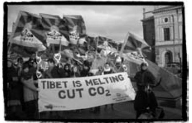
SFT UK and the 'yaks' at the COP15 UN Climate Change Conference