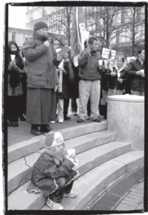
Tibetans in Boston holding weekly Lhakar vigil