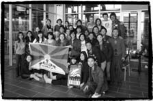
SFT Region 4 conference in Madison trained 40 students, including 6 who drove 9 hours from Kentucky!