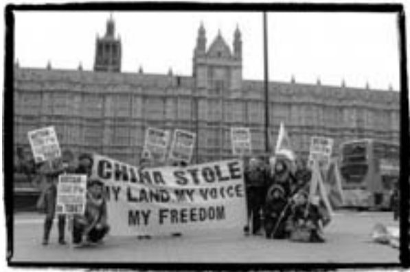
SFT UK amplifies Tibet's struggle in front of Parliament