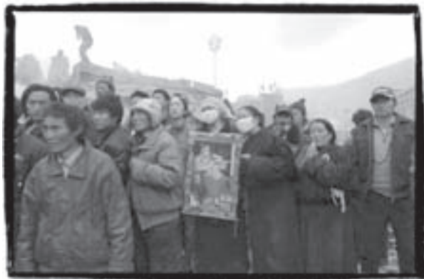
Tibetans carry a photo of His Holiness through the rubble