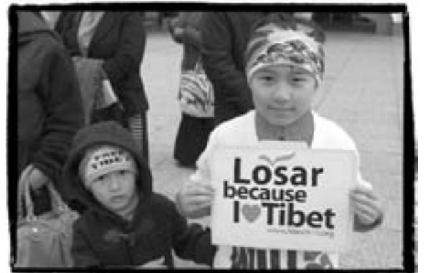
Third generation in exile and still in love with Tibet