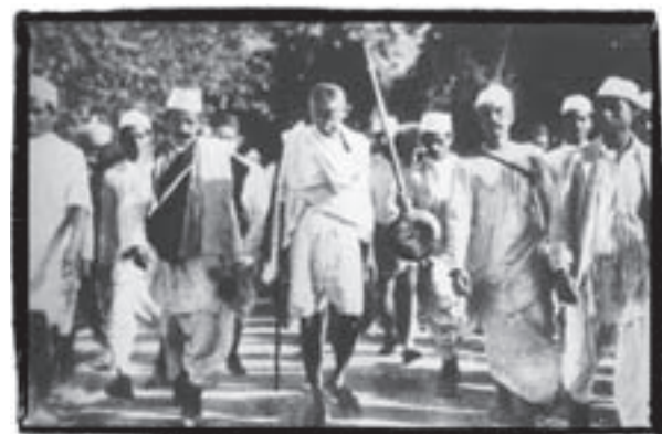
Mahatma Gandhi, Pioneer of Satyagraha

This gathering storm – a combination of cultural renaissance and political revolution – will ultimately wipe out China's oppression, leaving in its wake a Tibet ruled by Tibetans. Half a century after Gandhi died, his satyagraha is reborn in Tibet. This time its name is Lhakar.